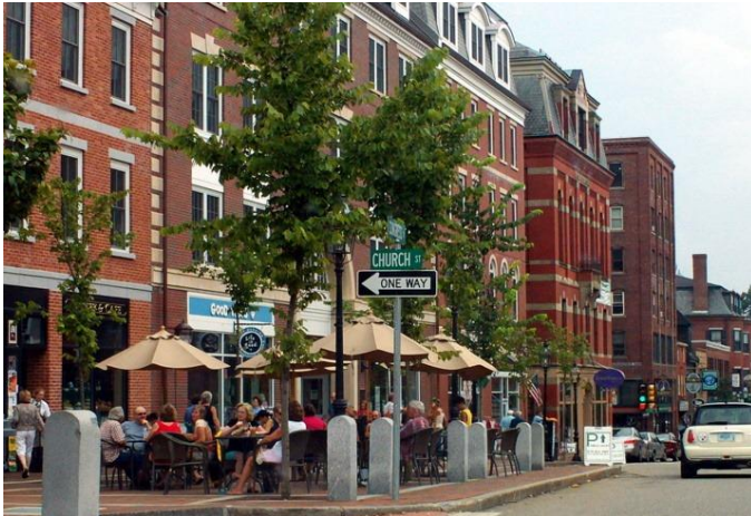
Smart Growth decisions lead to vibrant downtowns